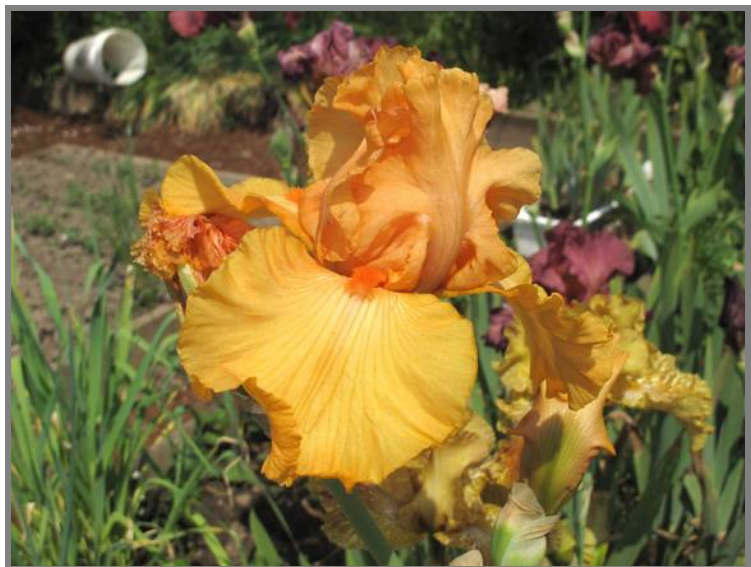
Iris ‘Good Show’