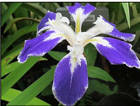
'Monstrosa' Reid 2001 Laevigata