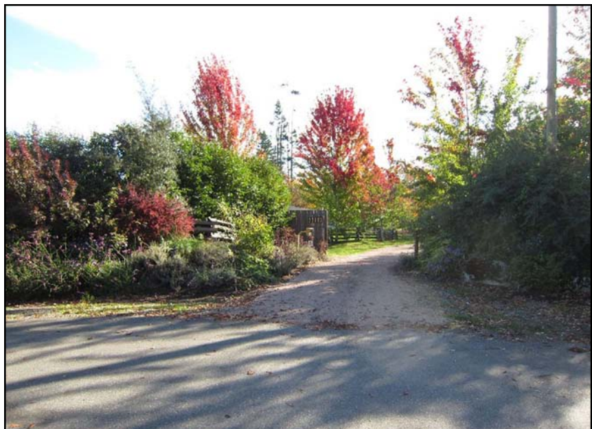
Entrance to Hobbs Farm