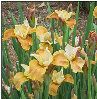
'Butterscotch Fizz' Schafer/Sacks 2013