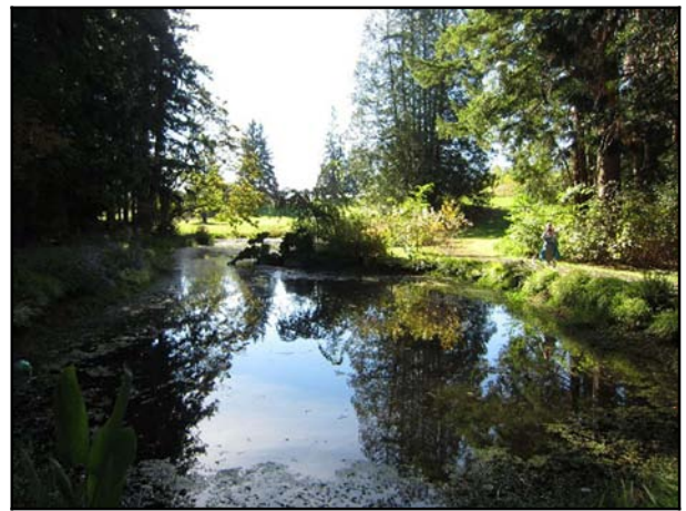
New Spring-fed Pond