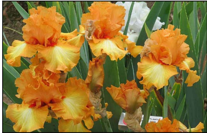
'Great Balls of Fire' [Aitken 2011] TB

This convention was filled with beautiful things to see and so many things to learn. Next time there is a spring meeting or convention in our area, be sure to take advantage of the opportunity and be there!