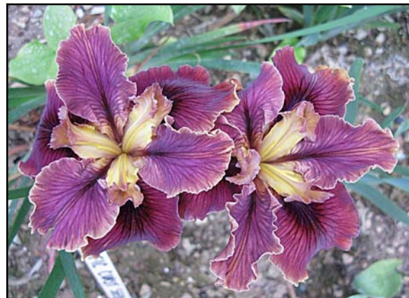
'Saltspring Sunburst' [Prothero 2010] PCN, HM 2015