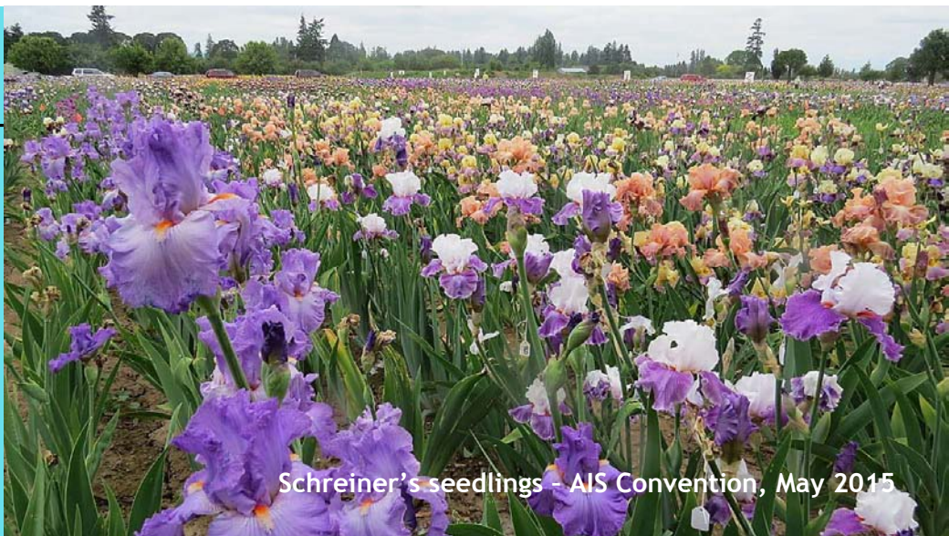
Schreiner's seedlings - AIS Convention, May 2015

You have the option of receiving electronic versions of the Bulletin. To request e-delivery, contact Diane at <voltaire@islandnet.com> .