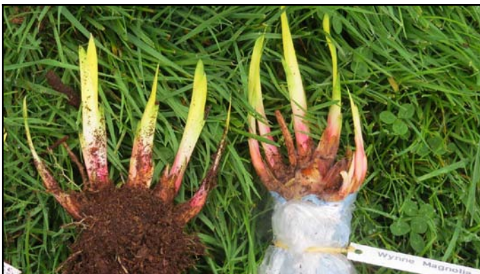
Siberians upon arrival after shipping showing bulk-wrapped and individually-wrapped versions