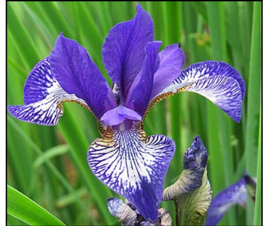
'Lorena Cronin' A Cronin R1991