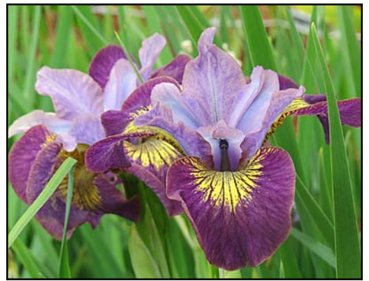
One of Kevin's seedlings