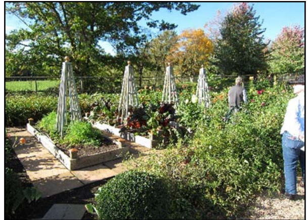
Fenced veggie and plant garden