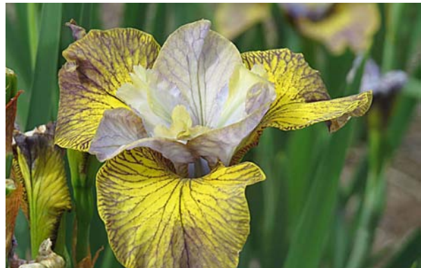
'Theme and Variation' [Schafer/Sacks 2015] SIB