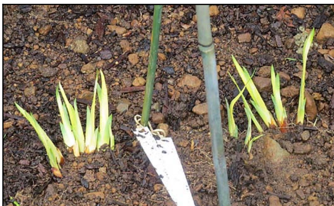
Newly planted Siberians