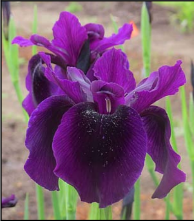
'Black Garnet' Reid 1996