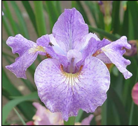
'Jannassee' Hollingworth 2014