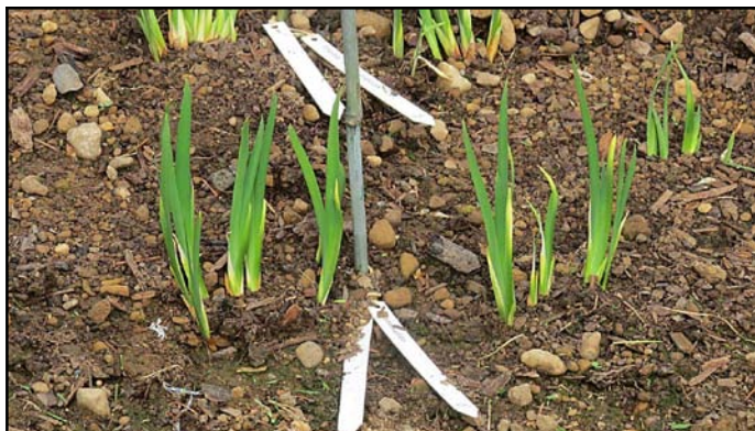
Siberian transplants showing green leaves about three weeks after planting.