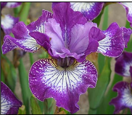
'Something Shocking' Hollingworth 2013