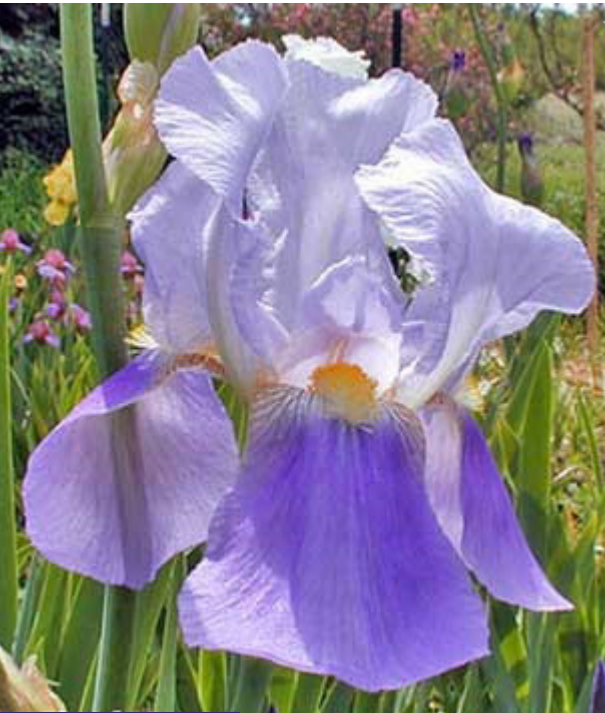
Lord of June