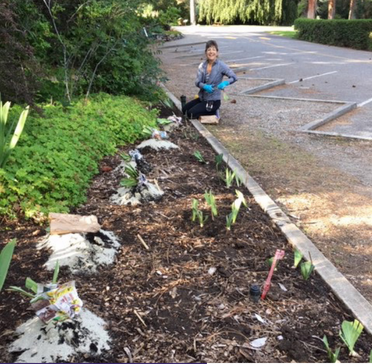
Lulu Lemman planting irises