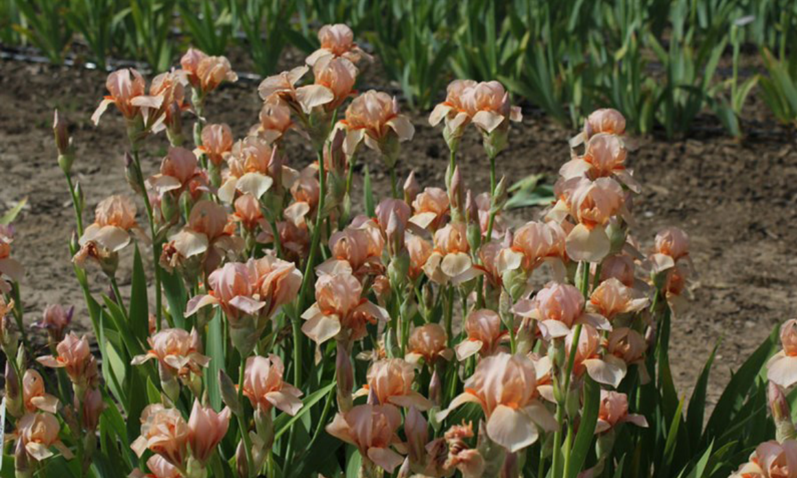
Plinko iris at Mid America Garden in Salem, Oregon

newsletter about the historic Iris collection.