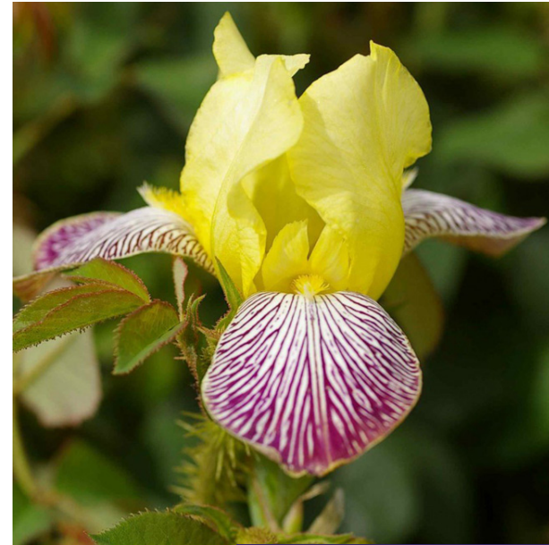
Historic iris, Gracchus

We thank our Okanagan members for their tremendous effort in planting a wonderful display garden of many varieties. We look forward to a riot of colour in the spring and many springs to follow. We will be providing more information on these display beds in the future.