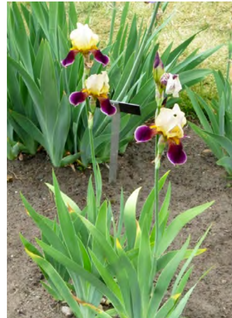
A clump of Shah Jehan (TB) in flower at the Central Experimental Farm Ottawa in June 2023. Rhizomes were sent from BC's Sage Hill Farm in the summer of 2022.

Considering their success and our observations of the rapid increase and durability of this BC tall bearded iris we recommend it strongly for the easy-care corner of the garden. You will enjoy the reliable bloom of our BC historic iris for years to come.