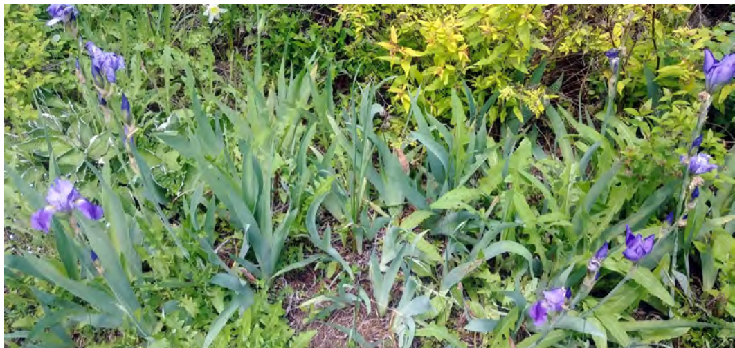
Healthy iris fans and flowers in Keith and Delberta Dufresne's Chimney Lake garden. [R. Hebda: note the absence of leaf spot and tip browning.]

When they purchased their Chimney Lake home several clumps of tall and intermediate bearded iris were thriving already in the gardens around the house. The property is about 900 metres (almost 3000') above sea level and is subject to strong summer heat and intense winter cold (at the transition of plant hardiness zones 4/5). The adjacent lake covers about 400 hectares or 1000 acres and normally freezes over in December with the ice fully receding by mid-April. "Since we moved here we have expanded the area of iris plantings by dividing the rhizomes regularly.