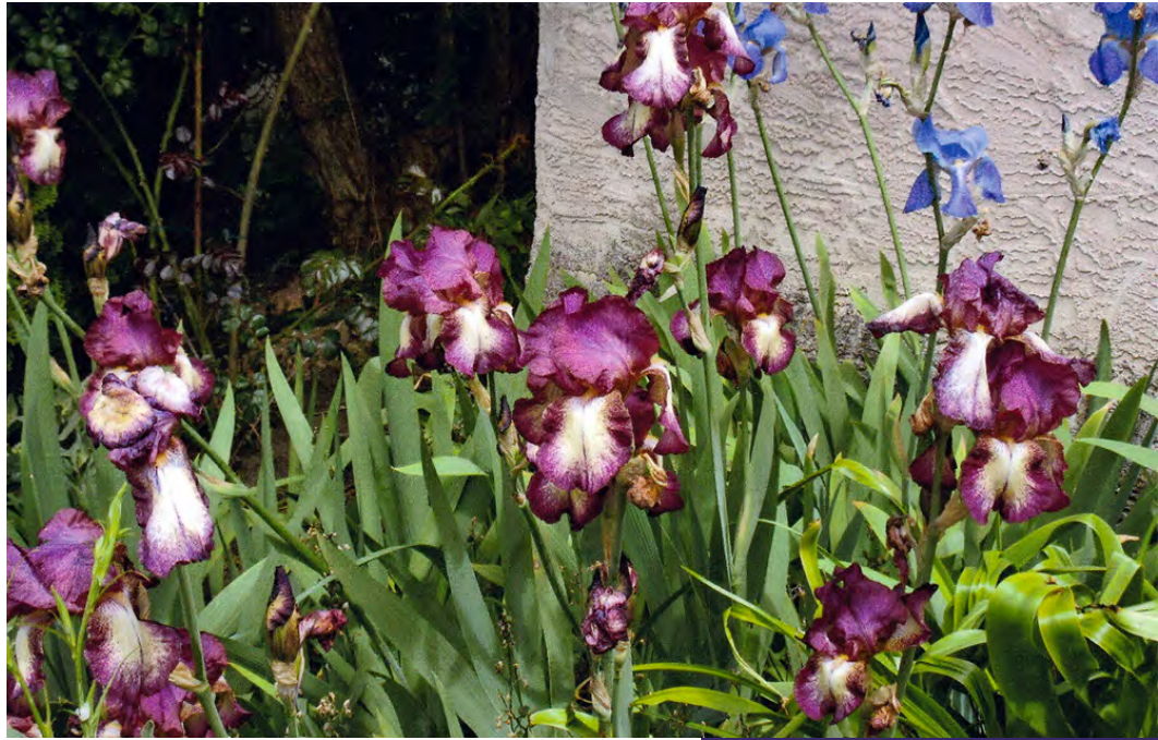
Gibson Girl with Dalmatian iris in the background