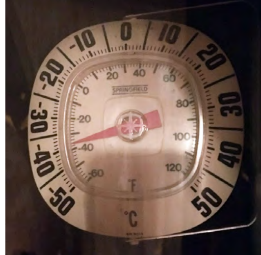
Thermometer reading showing bitter cold winter temperatures (close to -40 C or -40 F) and the irises survived just fine.

irises are hardy! "5:30 AM during the winter of 2020-2021 – minus 36 degrees C! We already had 30 cm+ of snow by this time, so the iris were fine for the most part. Not so great for vehicle batteries and heating bills" commented Keith.