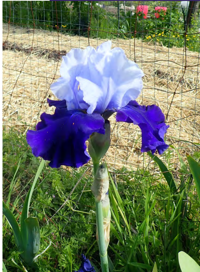
Over Alaska Tall Bearded iris blooming June 8, 2022, Saanich BC.