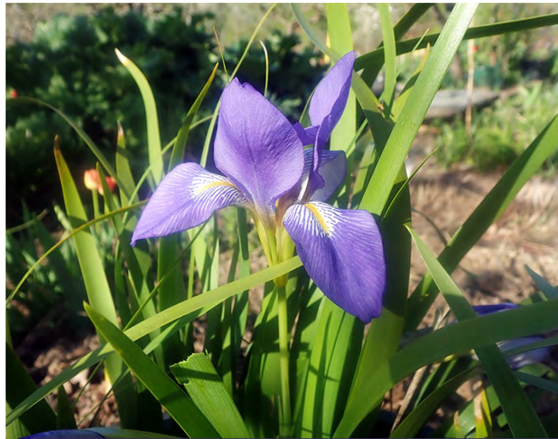
Figure 2: Fully open flower of Lazistan iris ( Iris lazica ) showing yellow and white areas on the falls with lavender stitching extending into the solid violet zone. Saanich Peninsula, April 30, 2023.

Iris lazica blooms in late February and March in its native range, but April to early May on the Saanich Peninsula of south Vancouver Island. Flowers are single on short stems, generally pale to mid-violet and reach about 7-10 cm (3-4") wide (Figure 1,2). The standards are erect and wide; falls are typically drooping and wide. Falls have a yellow crest/signal surrounded by a whitish area in the centre of the blades. Lavender stitching occurs throughout the yellow and white zones progressing into dark lavender veins in the violet portion of the fall. Stigmatic arms are short and have a very irregular margin. The base of blades and falls is pale green. This iris has a curious feature of buds emerging at a right angle to the stem before straightening in full bloom (Figure 1).