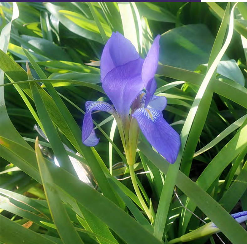
Figure 1: Opening flower of Iris lazica (Lazistan Iris) blooming on the Saanich Peninsula, April 30, 2023. Note the bud pointing horizontally in the lower right corner.

Lazistan iris is a beardless, evergreen, clump former from the eastern Black Sea coast native to northeastern Turkey and adjacent Georgia. In the wild, clumps consist of masses of moderately narrow leaves standing about 25-50 cm (10-20") tall. Leaves are typically 25 cm (10") long by 1-1.5cm (half inch) wide, though vary widely in length. In gardens, according to some sources, this iris grows 30-60cm (12-24") tall and 60 cm (24") wide or more.