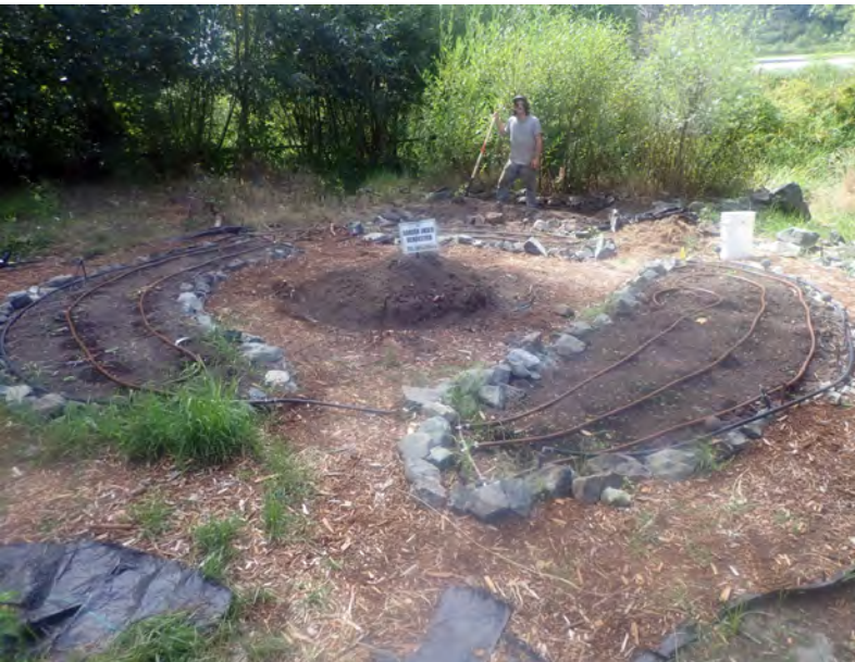
Preparing the AIS Region 13 Convention 2025 beds-to-be at the Horticultural Centre of the Pacific, Saanich BC, August 8, 2023.