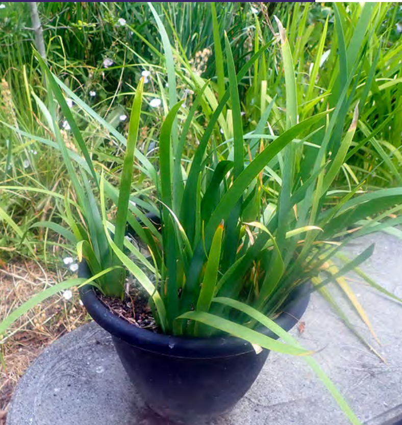
Figure 3: Pot of Lazistan Iris ( Iris lazica), July 12, 2023, Saanich, BC.

Iris lazica has received the Award of Garden Merit from the Royal Horticultural Society (RHS) and according to them it survives winter temperatures in the -10 to -15 C (14-5 F) range. Like my Algerian iris, this species is strongly deer-resistant. One website notes that Lazistan iris has some toxicity to dogs, cats and horses. It may be an irritant to people though I have had no problem handling the plants.