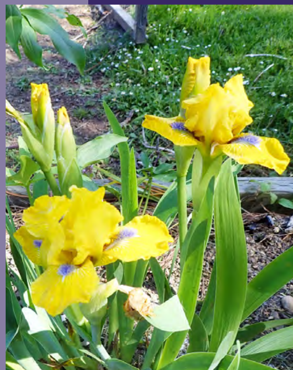
Gold Reward (SDB), May 8, 2020, Saanich Peninsula.