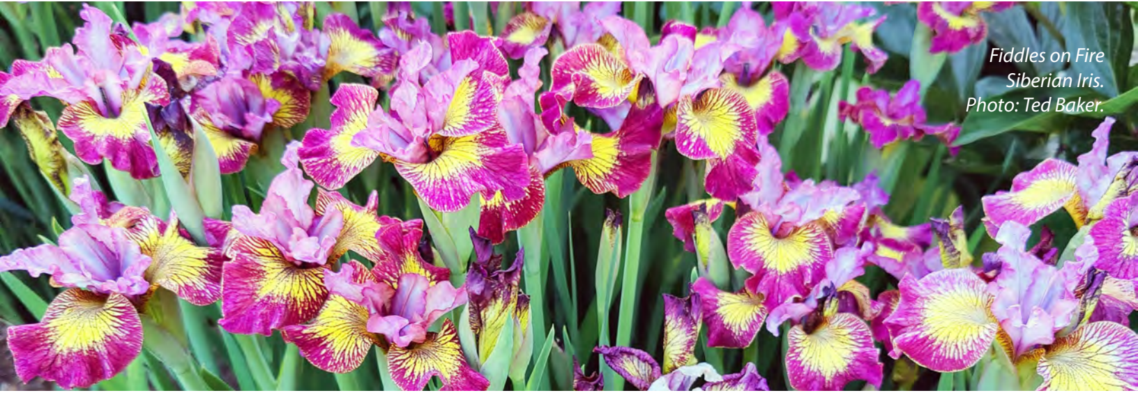
Fiddles on Fire Siberian Iris.